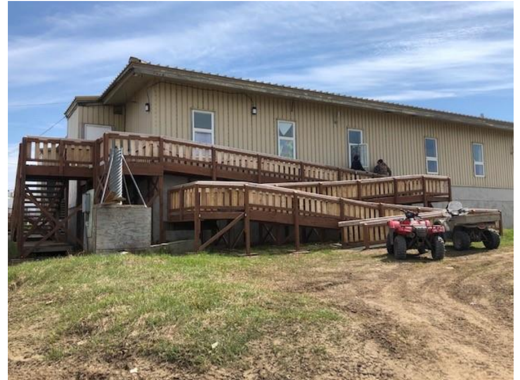
Bay Haven Domestic Violence/Sexual Assault Shelter Hooper Bay, Alaska