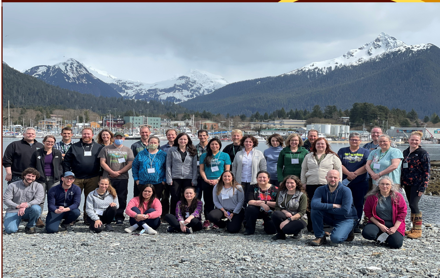
Above: CALS Course Participants and Instructors—Sitka

CALS Course November 18-20, 2022 Anchorage, Alaska