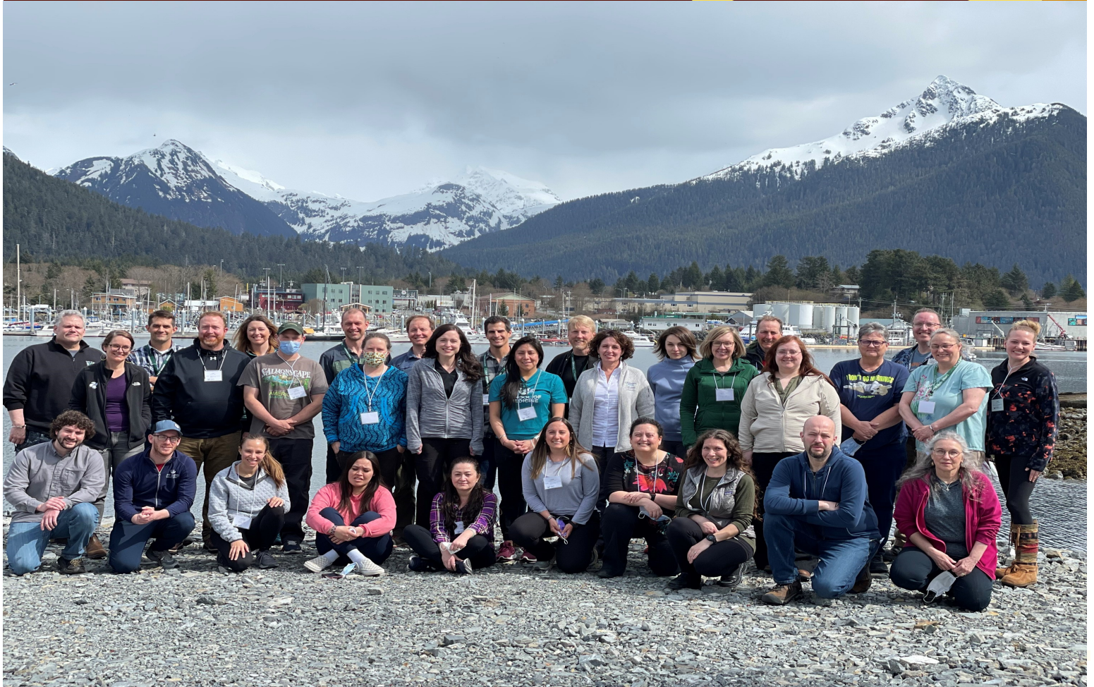
Above: CALS Course Participants and Instructors—Sitka

CALS Course November 18-20, 2022 Anchorage, Alaska