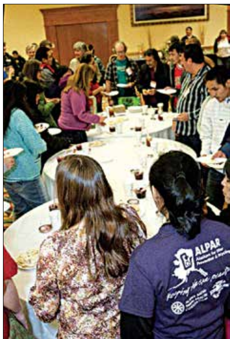
Alaska Tribal Conference on Environmental Management (ATCEM) participants enjoy tasty traditional treats during the Jam-Jam, a new addition to the popular ATCEM event.

This year's numerous breakout sessions and workshops focused on key topics impacting the interaction of health and the environment in and around Alaska communities: water; air quality; healthy homes;