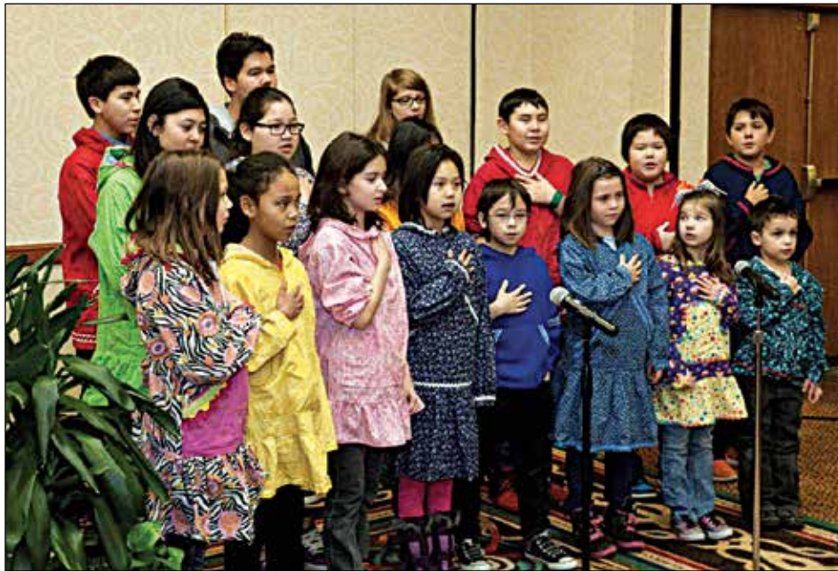
Students from the Alaska Native Cultural School recite the Pledge of Allegiance in Yupik during the Alaska Tribal Conference on Environmental Management event.