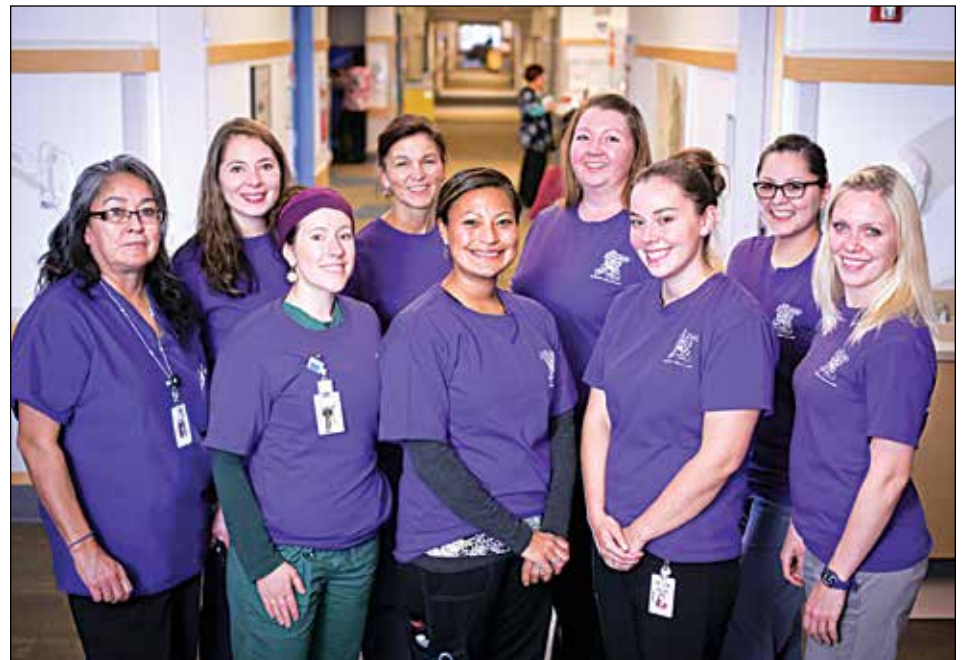
ANMC Adult Inpatient Surgery RNs are the driving force behind the Releasing Time to Care program at ANMC, which allows nurses more time with patients.