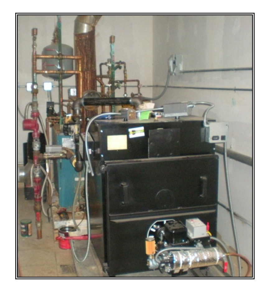
Used Oil Recycling Project