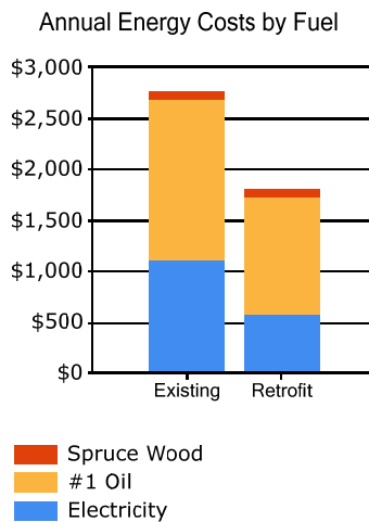
Figure 3.2 Annual Energy Costs by Fuel Type

Figure 3.3 below addresses only Space Heating costs. The figure shows how each heat loss component contributes to those costs; for example, the figure shows how much annual space heating cost is caused by the heat loss through the Walls/Doors. For each component, the space heating cost for the Existing building is shown (blue bar) and the space heating cost assuming all retrofits are implemented (yellow bar) are shown.