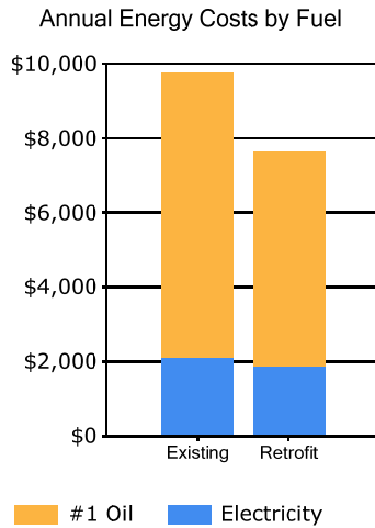
Figure 3.2 Annual Energy Costs by Fuel Type

Figure 3.3 below addresses only Space Heating costs. The figure shows how each heat loss component contributes to those costs; for example, the figure shows how much annual space heating cost is caused by the heat loss through the Walls/Doors. For each component, the space heating cost for the Existing building is shown (blue bar) and the space heating cost assuming all retrofits are implemented (yellow bar) are shown.