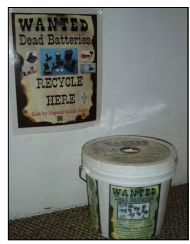
Battery recycling in King Cove