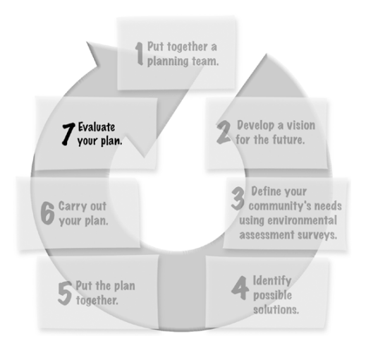
Step 7: Evaluate your plan

After you produce and carry out your plan, it is important to measure how well it worked and make any changes necessary to improve the plan. Develop a good monitoring system that guides workers/volunteers in measuring accomplishments. This way you will know if the actions taken have been successful or effective. One of the easiest methods for keeping track of work preformed is to take digital photos before and after any work is done. Perhaps a community environmental advocacy group could be formed to monitor the progress of the projects. This will motivate the workers as well