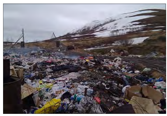
Many villages rank their landfill as a high priority

Once you have developed a vision for the future and are familiar with possible environmental issues in your community, the next step is to have your community identify and prioritize the environmental issues. One way to identify and prioritize environmental issues in your community is to survey the entire community so everyone has the opportunity to provide input, support, knowledge and understanding of the issues. You can use the Village