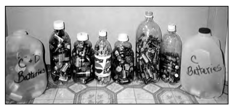
A simple solution for keeping batteries from polluting the landfill

For the most up to date storage and collection information contact Total Reclaim in Anchorage or visit <a href="http://www.totalreclaim.com/alaska.html">http://www.totalreclaim.com/alaska.html</a>