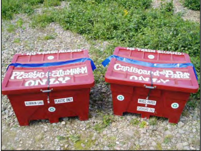
Savannah Yatchmeneff tests out the recycle bins crafted out of old fish totes in King Cove