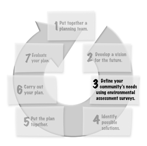
Step 3: Define your community's needs using environmental assessment surveys

This step in community-based environmental planning is the main focus of the surveys in this manual. You will be able to identify some of your community's environmental needs using the environmental assessment surveys.