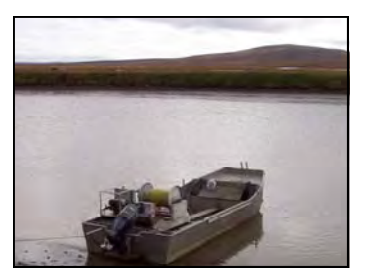
Tununak River