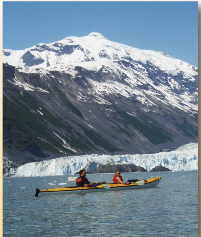
Kayakers explore the glacial Harriman Fjord in Barry Arm, Prince William Sound.

Space. The largest state in the union, Alaska's 570,374 square miles allow us to stretch our arms a bit.