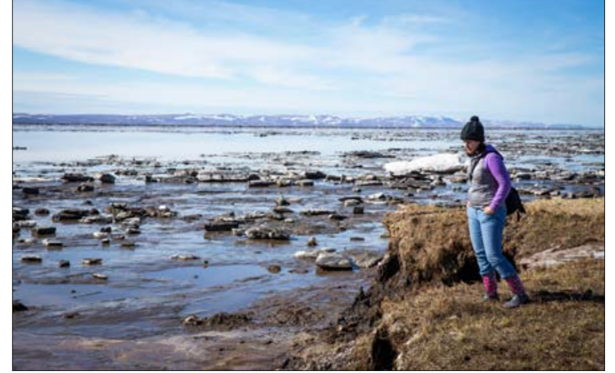
Newtok faces frequent storm-driven erosion. The move to Mertarvik will help ensure the sustainability and safety of the community.