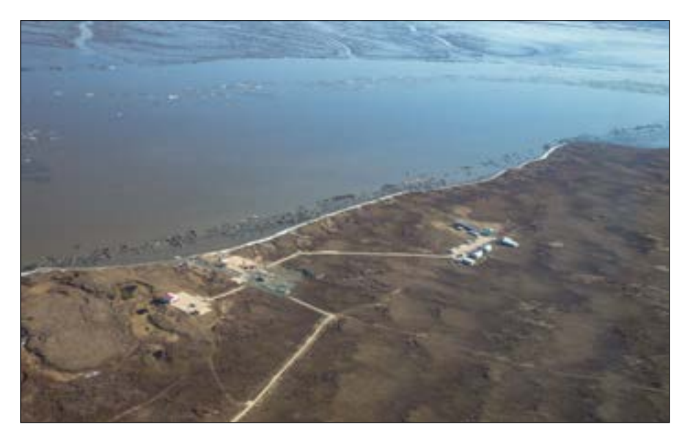
Aerial view of Mertarvik, nine miles downriver to Nelson Island, the planned relocation site of the community of Newtok.