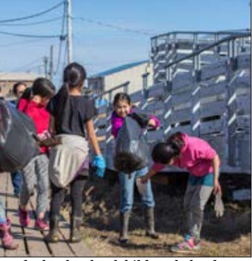
On the final day of school, schoolchildren helped clean and pick up trash in the community.