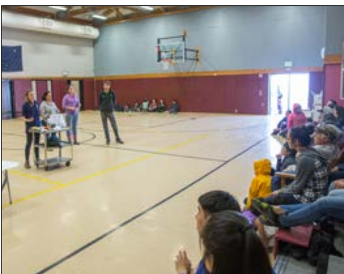
Two photos above: At a community meeting, Newtok Village Council and ANTHC staff engage community members about the planned relocation efforts.