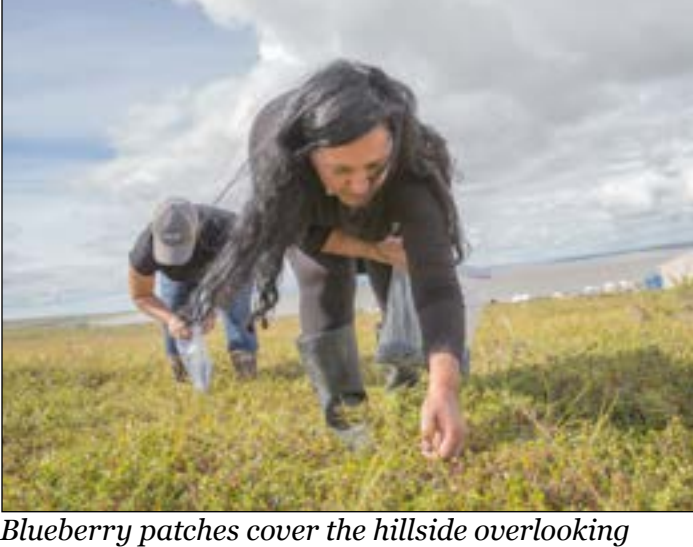
the Mertavik location and will provide bountiful harvests for the community's subsistence lifestyle.

Right: Construction crews are hard at work to build new homes for the relocation efforts.